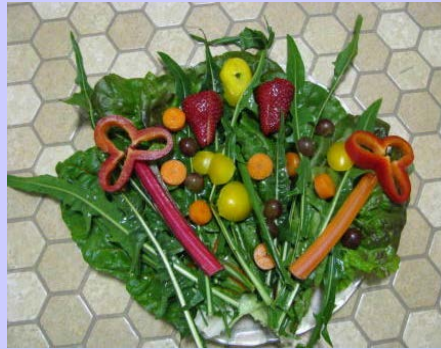
A close up of that birthday Salad!