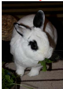
Adopted Oct. 9th