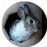
Snickers—Alias 'Lookout Lou'

No... Our bunnies aren't 'Wanted'; but Sponsorships are! Sponsorships and donations are desperately needed to keep Safe Haven going. Without your help, we would not be able to continue to rescue and re-home these wonderful creatures.