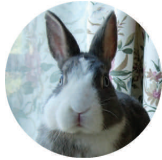
Frankie—Alias 'Ole Blue Eyes'