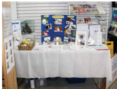
Educational Table Mike's Feed Farm, Totowa February 2005